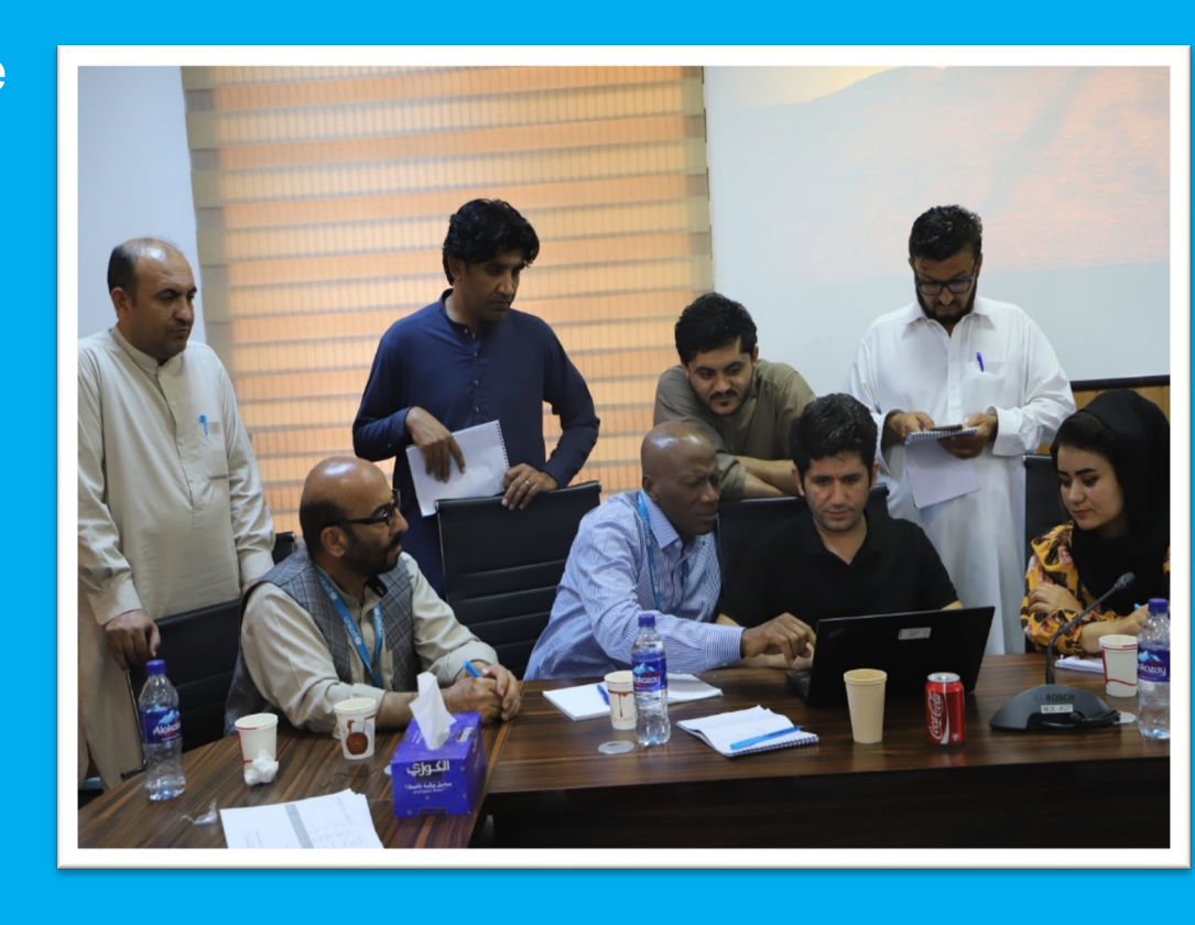
Misinformation Management Training - Kabul (August 2022)